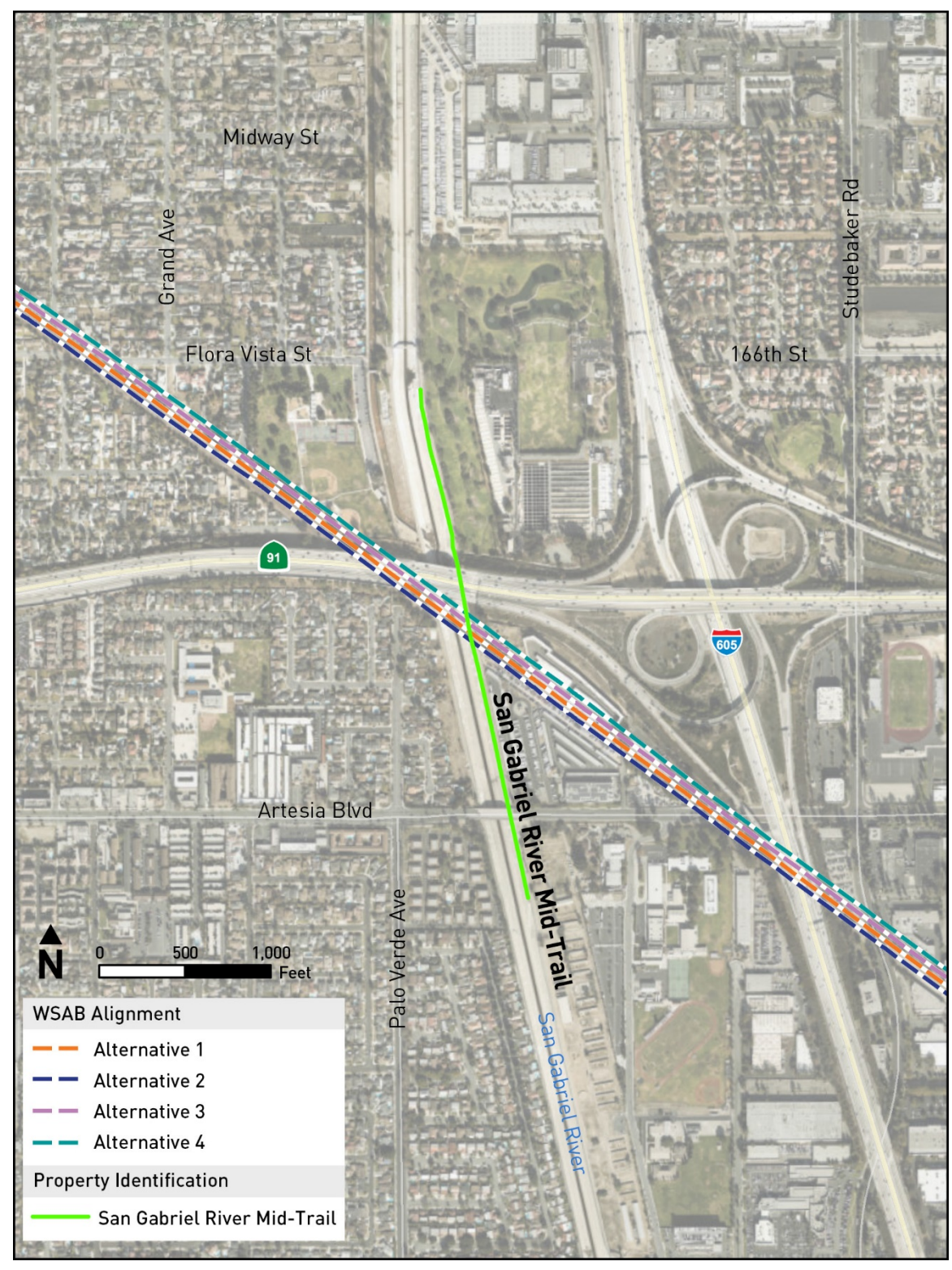
Figure 5-5. San Gabriel River Mid-Trail