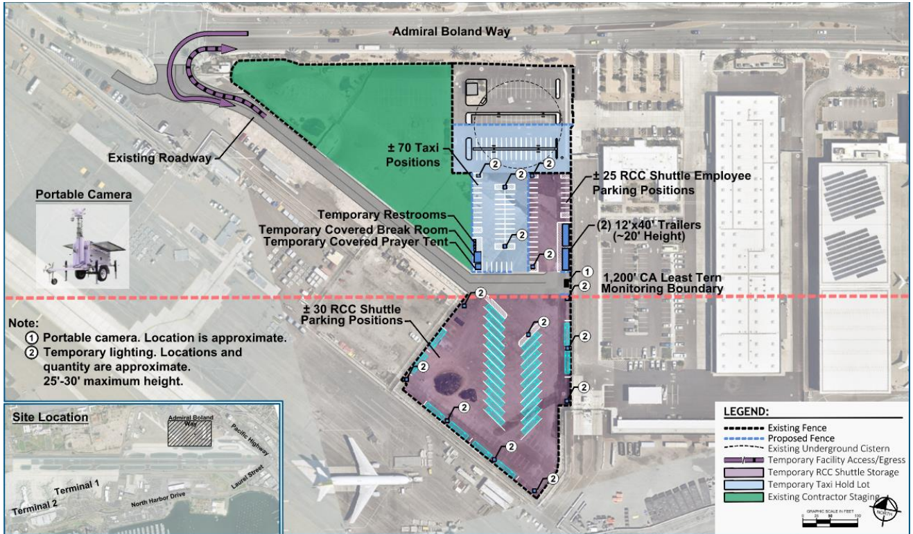
Figure 3 – Temporary Northside Ground Transportation Facilities Site Plan Concept