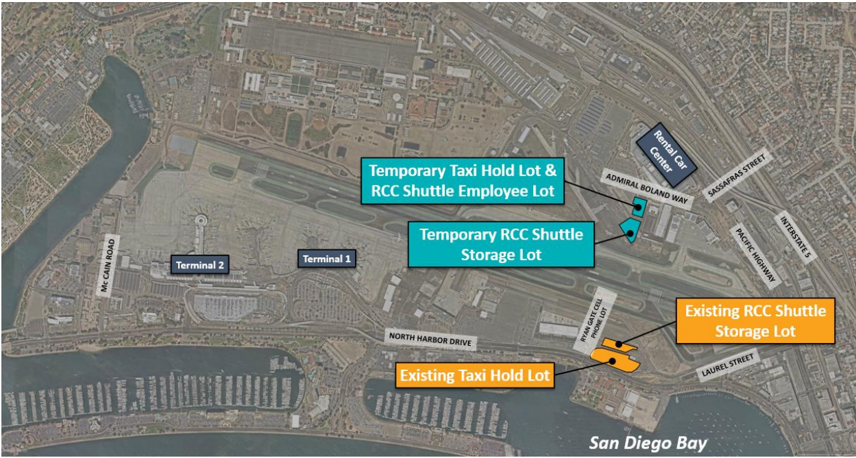
Figure 1 – Temporary Northside Ground Transportation Facilities Location