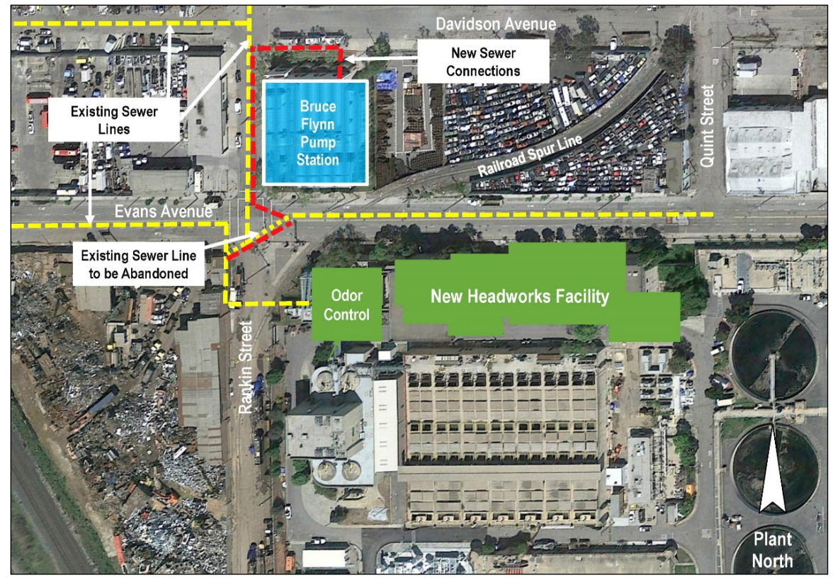
Figure 1: Headworks Replacement Project – Bruce Flynn Pump Station Sewer Connection