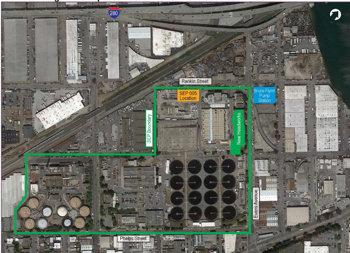
Figure 2: Proposed Location of SEP 005 Southeast Lift Station