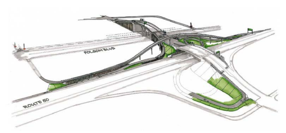
Prepared by the State of California Department of Transportation and County of Sacramento

The environmental review, consultation, and any other actions required by applicable Federal environmental laws for this project are being, or have been, carried out by Caltrans pursuant to 23 U.S.C. 327 and the Memorandum of Understanding dated December 23, 2016 and executed by FHWA and Caltrans.