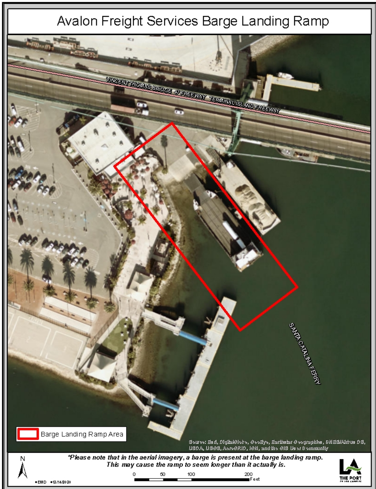
Figure 2 –Revised Proposed Project Area