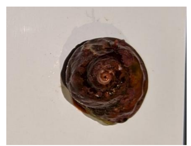
Black turban snail ( Tegula funebralis )