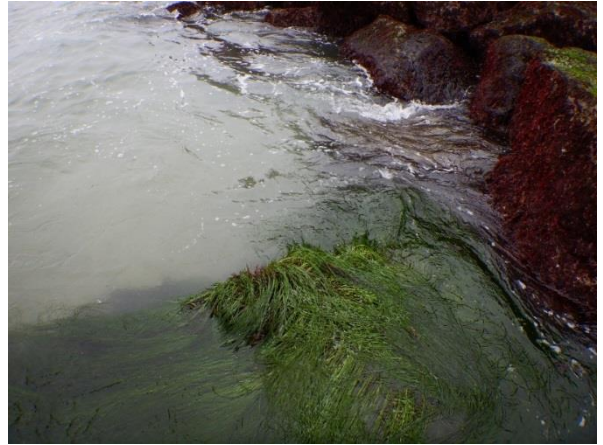
Torrey's surfgrass (Phyllospadix torreyi)