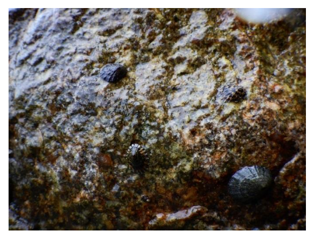
Limpets (Lottia limatula, L. scabra, L. scutum)