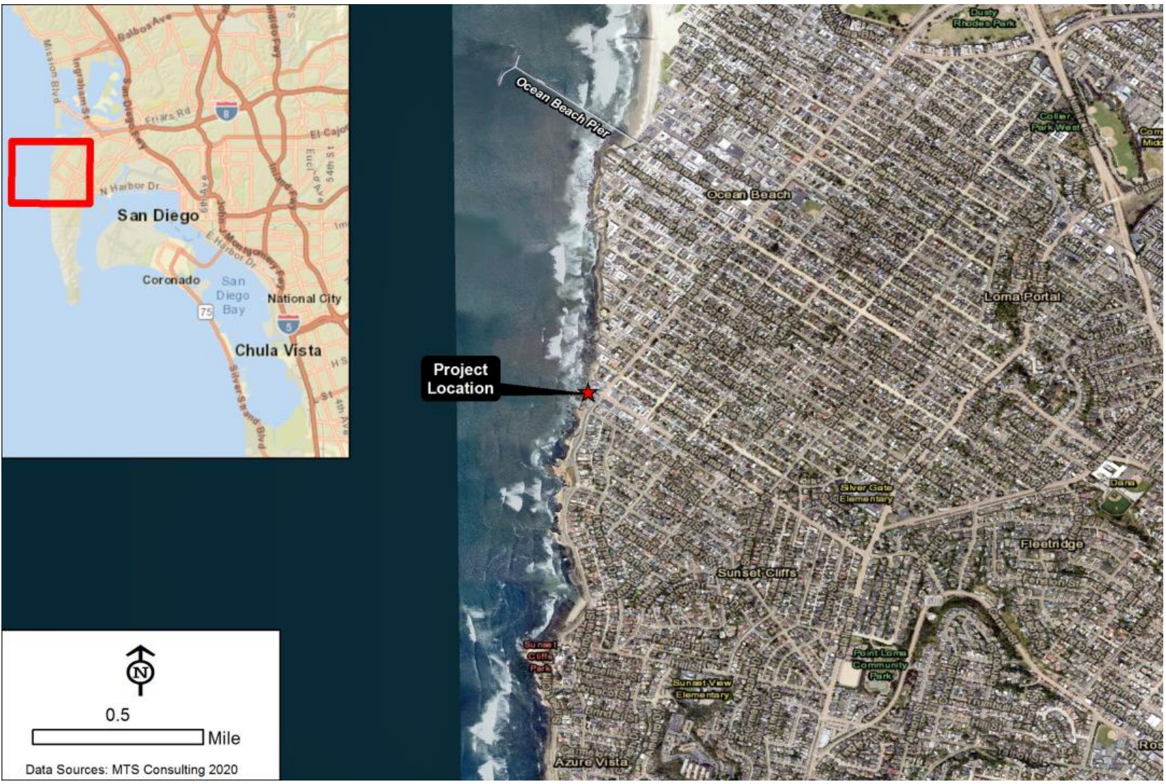
Figure 1. Project location and vicinity map for the Inn at Sunset Cliffs Pier Project.