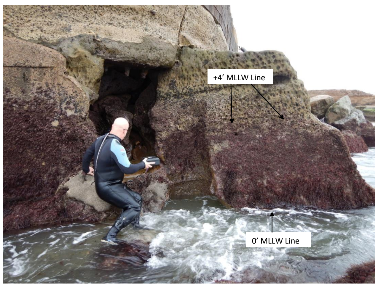
Figure 3. Small opening observed along the existing vertical seawall. The vertical limit of marine algae growth along the vertical seawall as shown here marks the +4' MLLW elevation boundary. Elevations are approximate and based on rough measurements to the water line and observed tidal elevations at Scripps Pier (NOAA Tidal Station 9410230).

Submerged areas surrounding the riprap revetment consisted primarily of coarse sand with wave-cut bedrock lying underneath. The riprap revetment itself contained numerous crevices within which small marine invertebrates could seek refuge. Occurring just offshore from the toe of rocky revetment was a small system of rocky reefs that stretched the full length of the survey area (Figure 4). In all, 54 square meters of rocky reef habitat was surveyed between 15 distinct rocky reef "microhabitats". These rocky reefs consisted of gently sloping wave-cut sandstone and were exposed to high wave energy and ocean swells. Each rocky reef microhabitat supported turf forming algae species, surfgrass, or a mixture of turf and surfgrass. The limits of each rocky reef microhabitat surveyed, along with the relative composition turf algae and surfgrass within each of these rocky reef microhabitats is listed in Table 2.