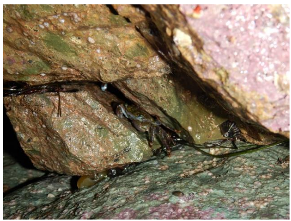
Lined shore crab (Pachygrapsus crassipes)