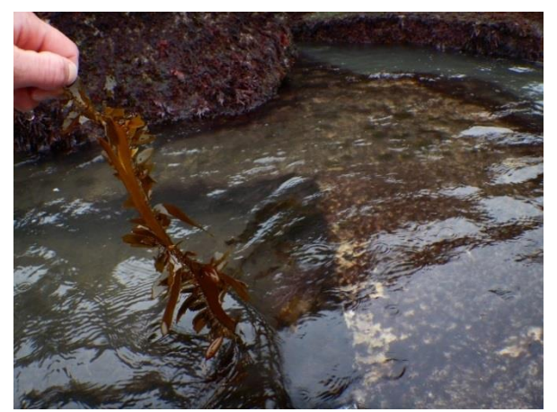
Brown algae (Egregia menziesii)