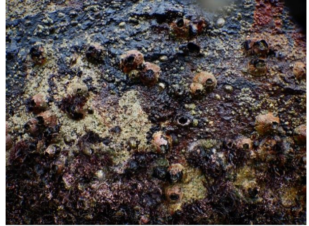
Pink acorn barnacle (Tetraclita rubescens)