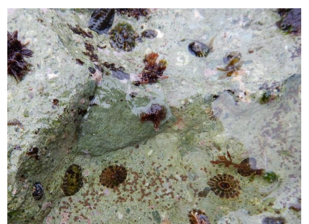
Chiton ( Mopalia spp.) and Limpets ( Lottia scabra , and L. pelta )