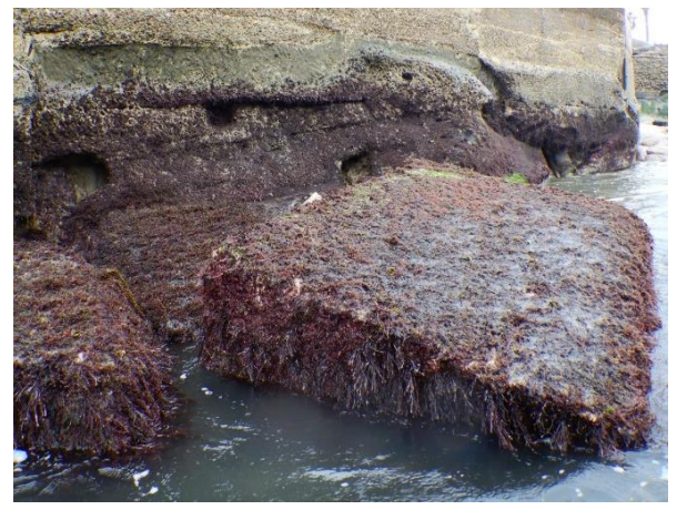
Red algae (Corallina spp., Mastocarpus spp., Gelidium spp., and Lithothrix asperqillum)