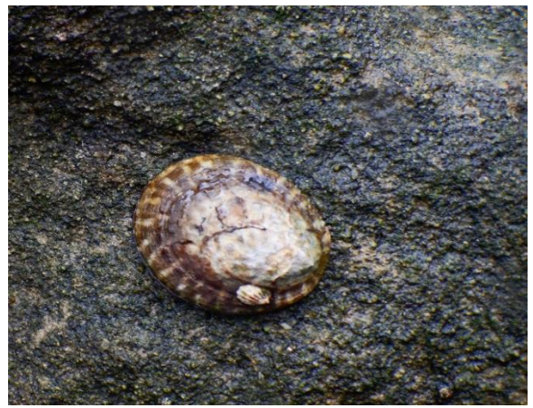
Owl limpet (Lottia gigantean)