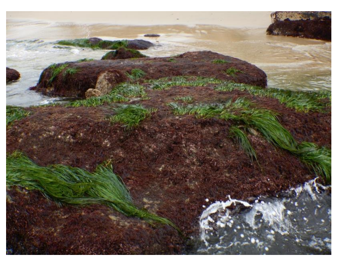
Figure 5. Reef ID #2 (90% turf algae/10% surfgrass).

Each of the 15 rocky reef microhabitats surveyed within the Project area were completely covered by either turf forming algae (generally Corallina spp., Mastocarpus spp., Gelidium spp., Lithothrix aspergillum) or surfgrass (Phyllospadix torreyi). While some microhabitats consisted either entirely of seagrass or entirely of turf algae, other microhabitats supported both vegetation types (Figure 5). Algae growth occurring within the upper intertidal (between 0' MLLW and +4' MLLW) consisted predominately of a mix of turf algae and crustose and coralline red algae species, with crustose algae growing along the vertical seawall up to just below +4' MLLW. Midto lowintertidal zones were