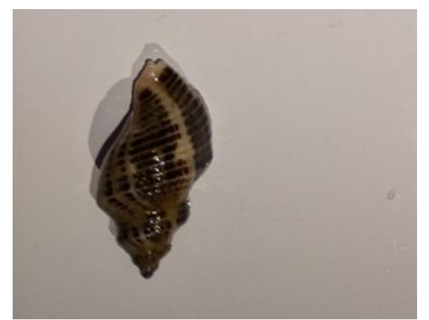
Dog whelk ( Nucella sp.)