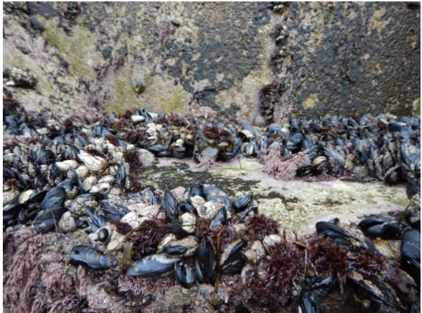
Gooseneck barnacle ( Pollicipes polymerus ) and California mussel ( Mytilus californianus )