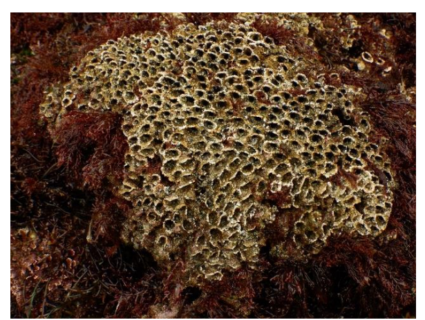
Sand Castle Worm (Phragmatopoma californica)