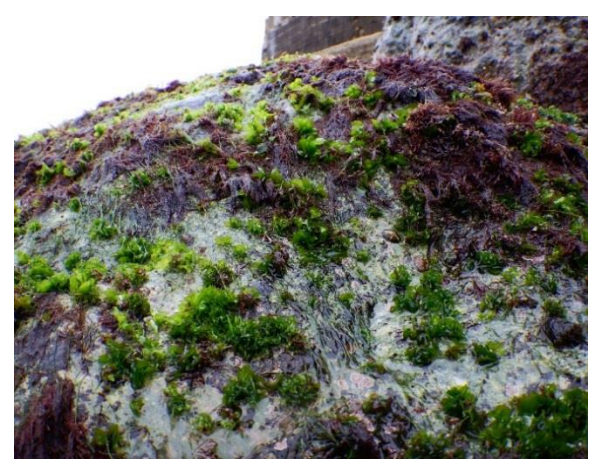
Green algae (Ulva spp.)