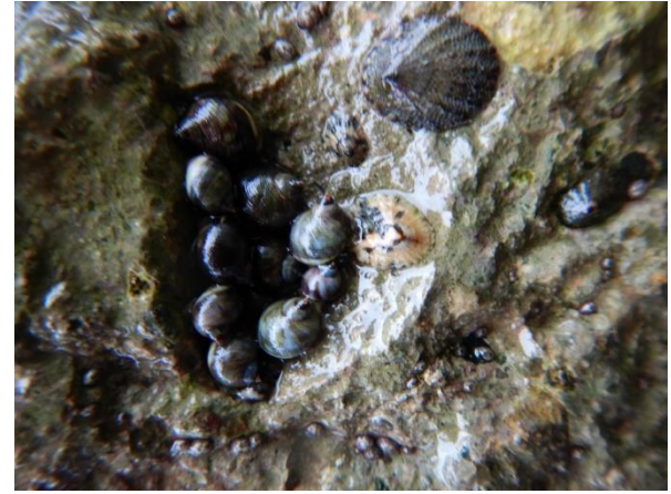
Periwinkle (Littorina spp.) and Limpets (Lottia limatula, L. scabra, L. scutum)