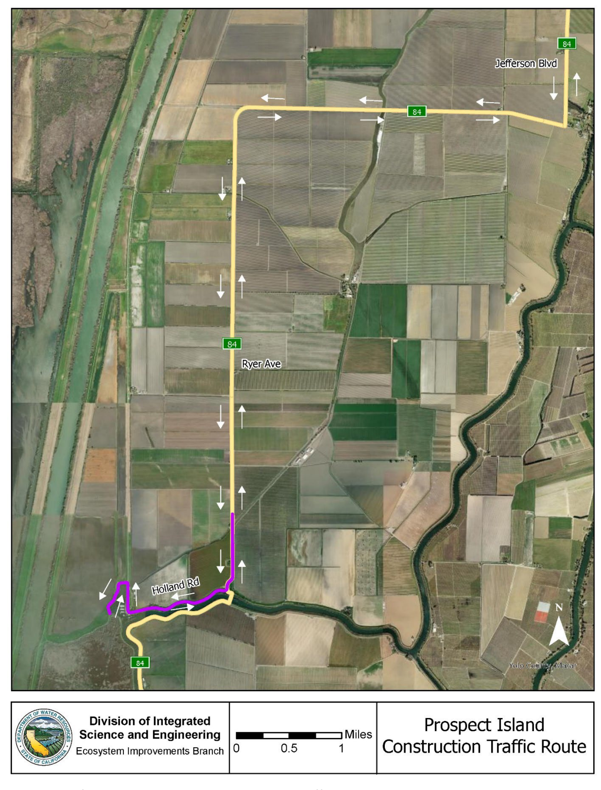
Figure 2: This figure shows the revised construction traffic route, using State Highway 84 and Holland Road.