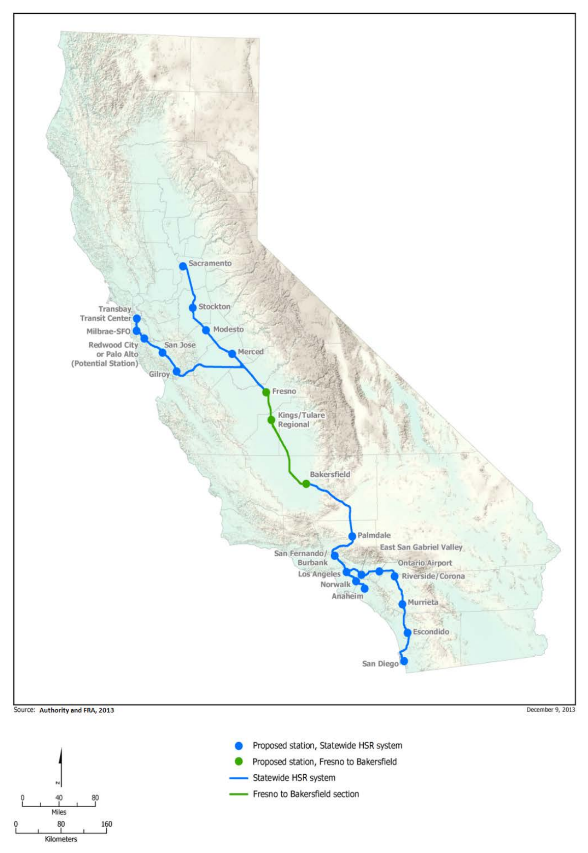
Figure 1-1 Statewide HSR System