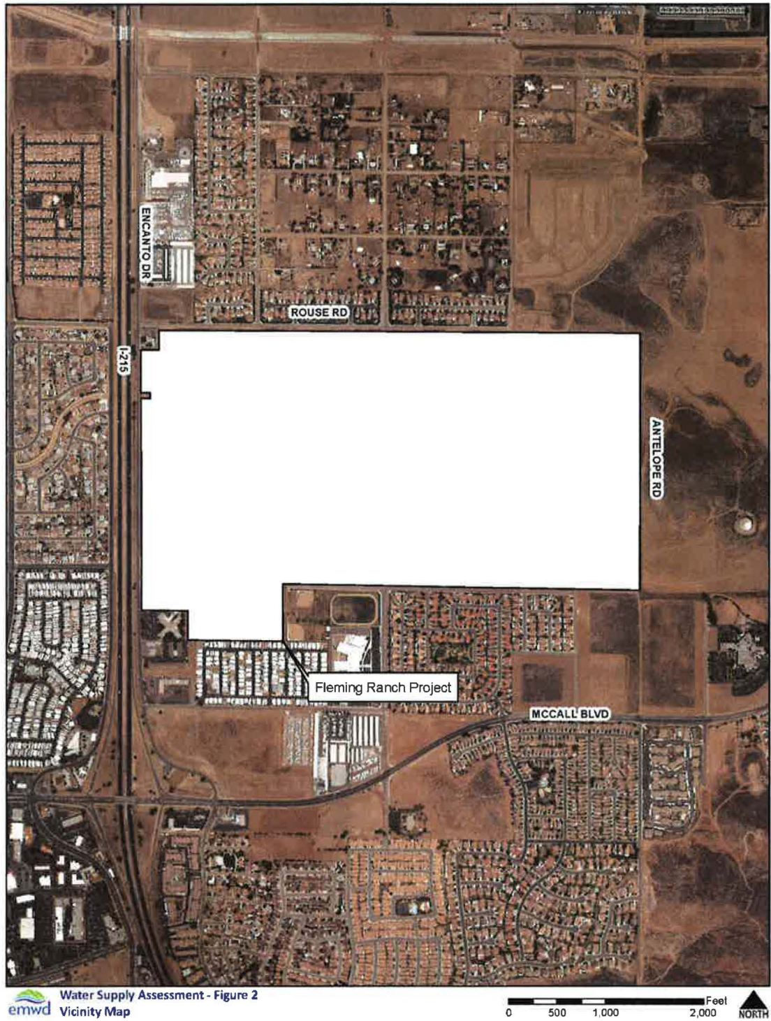
Figure 2: Project Location