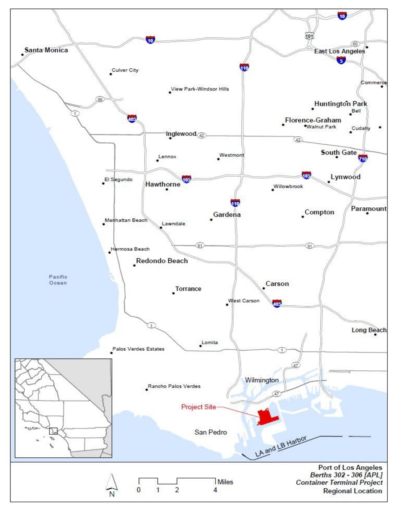
Figure 1 - Regional Location of the Proposed Project