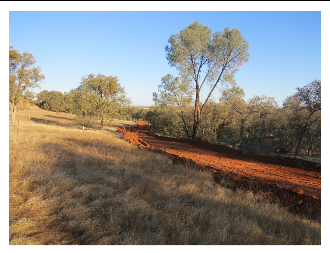
Photograph 11: A recently graded access road in the eastern portion of the project site; adjacent to oak woodland savannah.