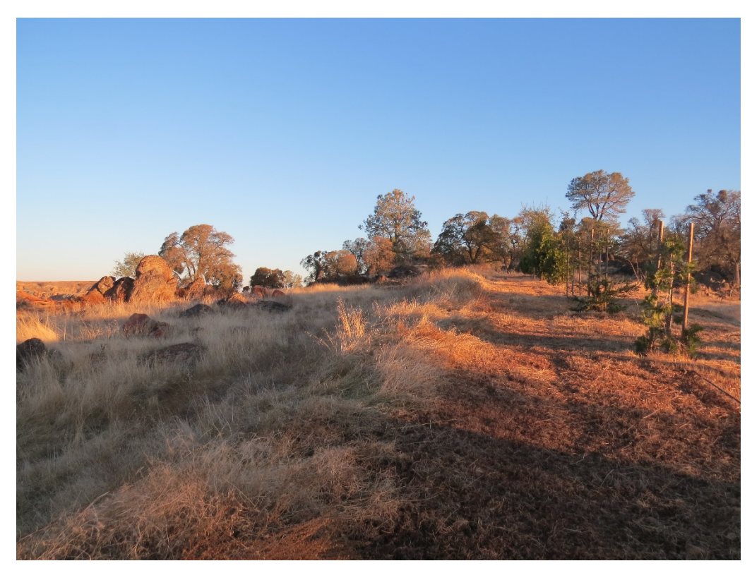
Photograph 2: From the southeast corner of the project site looking north along the eastern boundary.