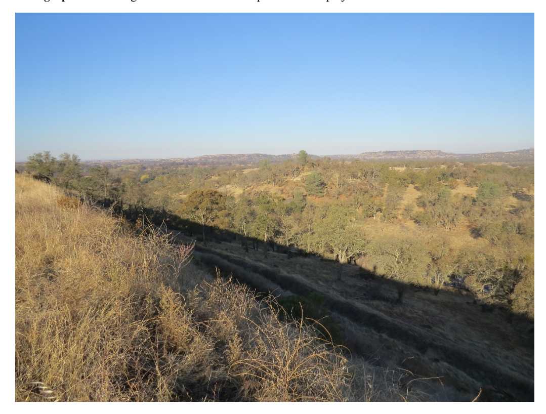
Photograph 5: Looking west across the northern portion of the project site.