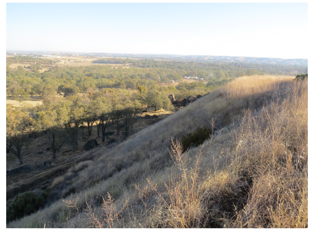
Photograph 5: Looking east across the northern portion of the project site.