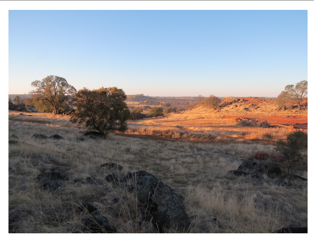
Photograph 3: From the middle of the eastern boundary of the project site looking west.