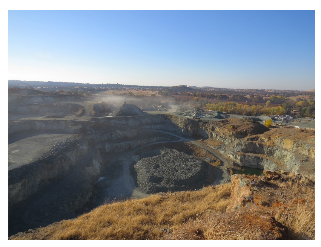
Photograph 7: Looking southwest across the active mining operations in the middle of the project site.