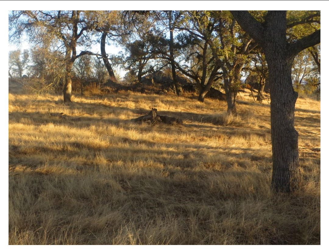
Photograph 9: Oak woodland savannah in the eastern portion of the project site.