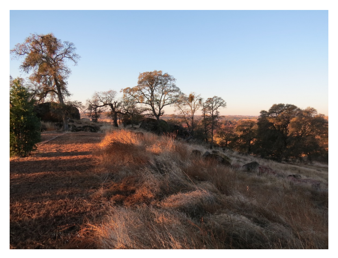
Photograph 1: From the eastern boundary of the project site looking southwest across the southeast corner.