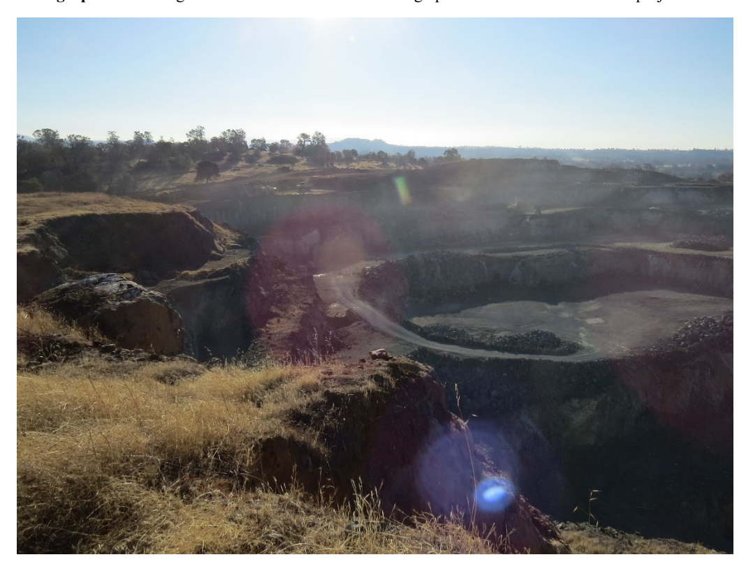
Photograph 8: Looking southeast across the active mining operations in the middle of the project site.