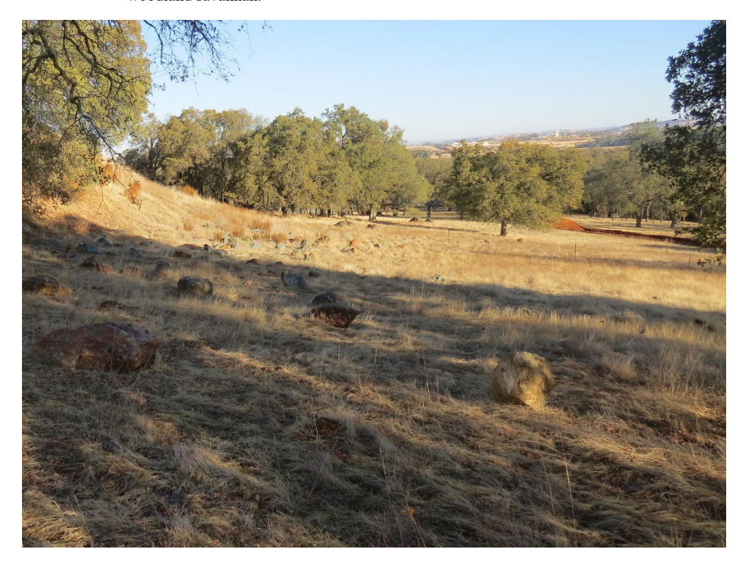
Photograph 12: A swathe of non-native grassland in between areas supporting oak woodland savannah.