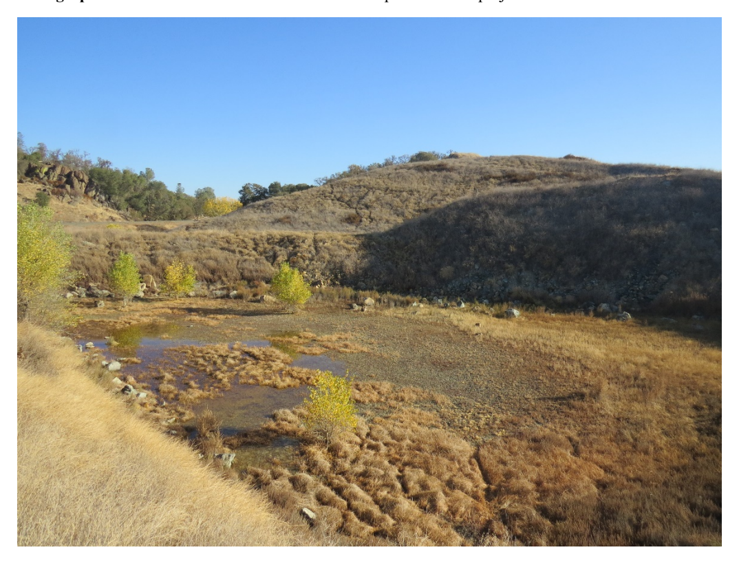
Photograph 10: Looking north across the water detention basin in the northeast corner of the project site.