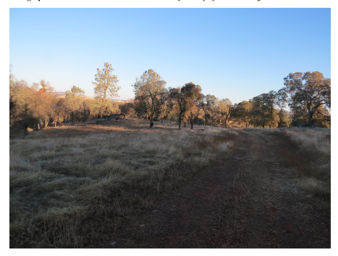
Photograph 4: Looking northwest across the northeast corner of the project site.