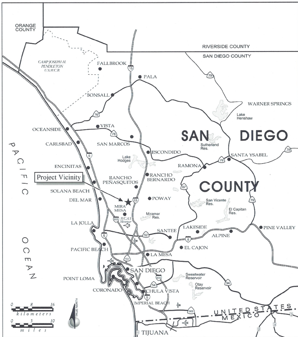
Figure 1. Project Vicinity Map