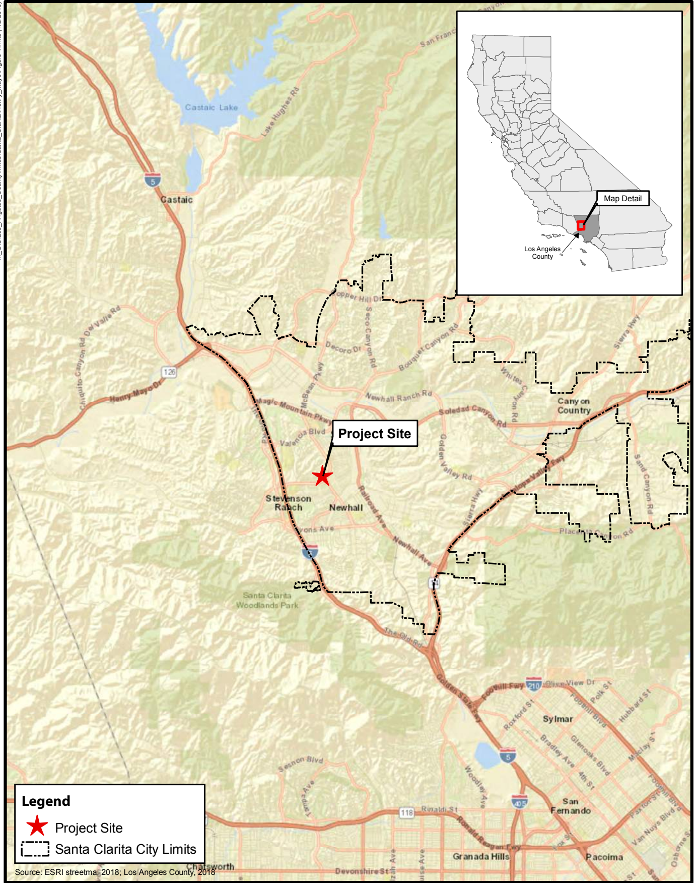
EXHIBIT A Regional Location Map

GIS\Los_Angeles_County\Mxds\Santa_Clarita\Henry_Mayo\Figure 1.mxd (7/2/2018)