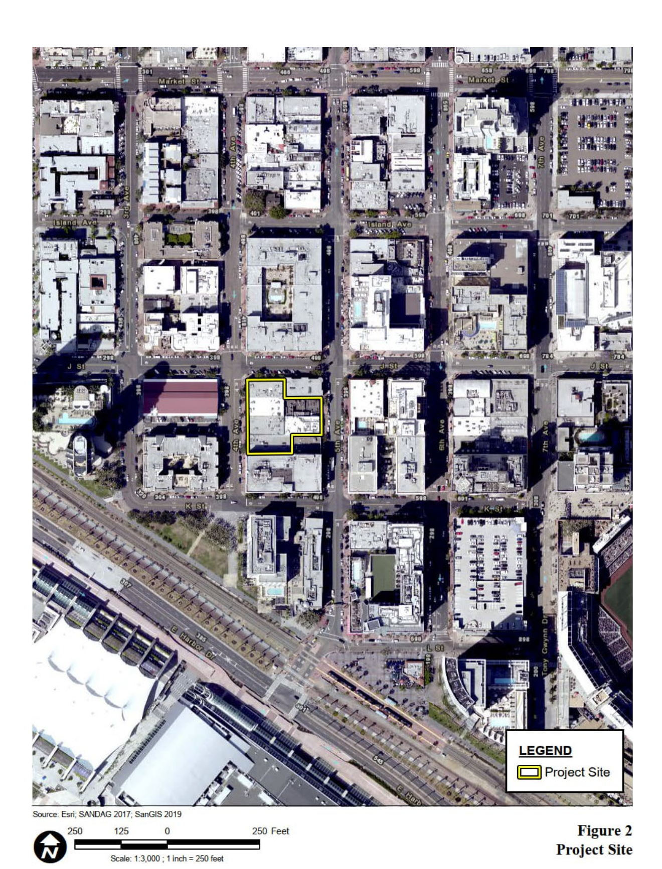
4th and J Project