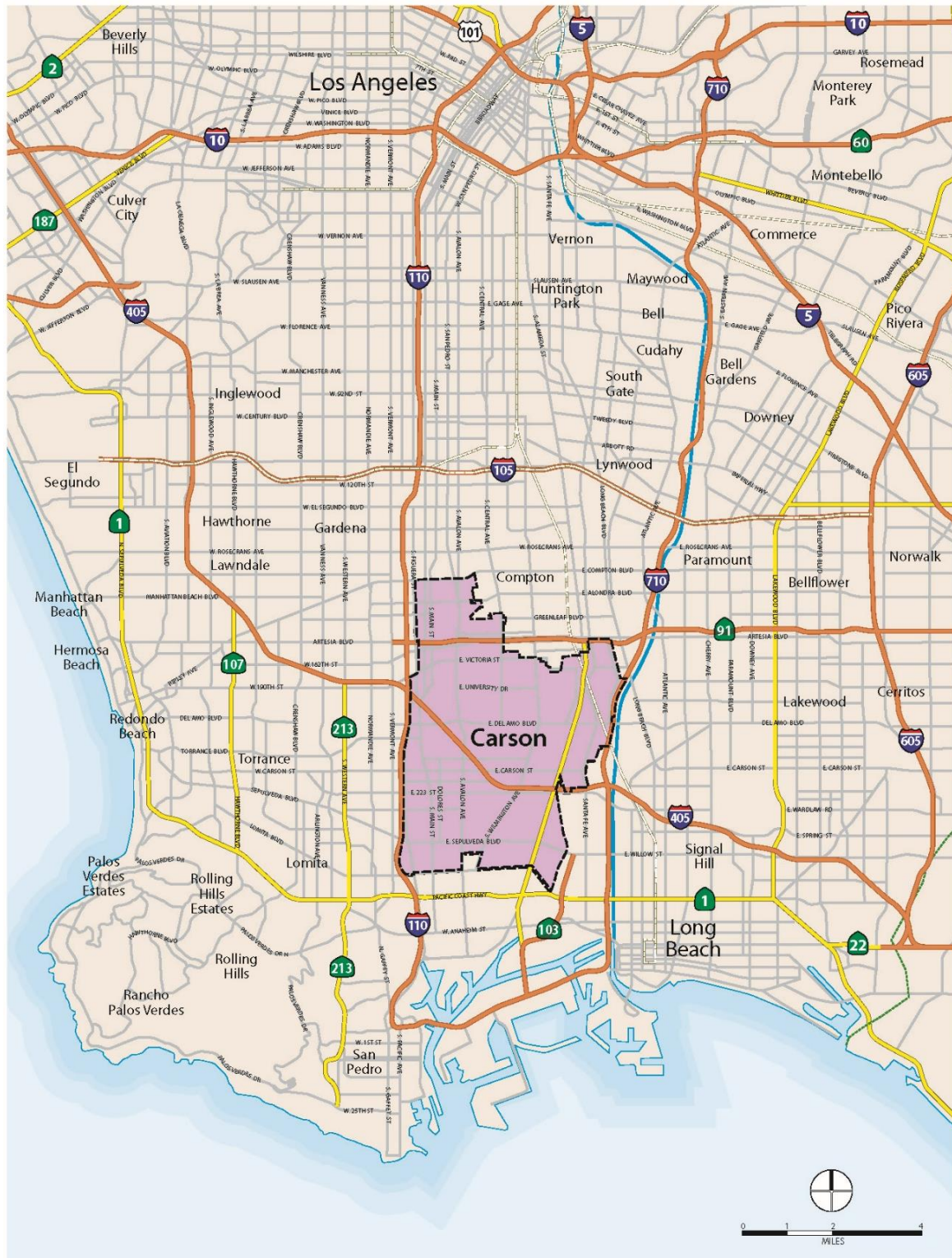
Figure 1. Regional Setting