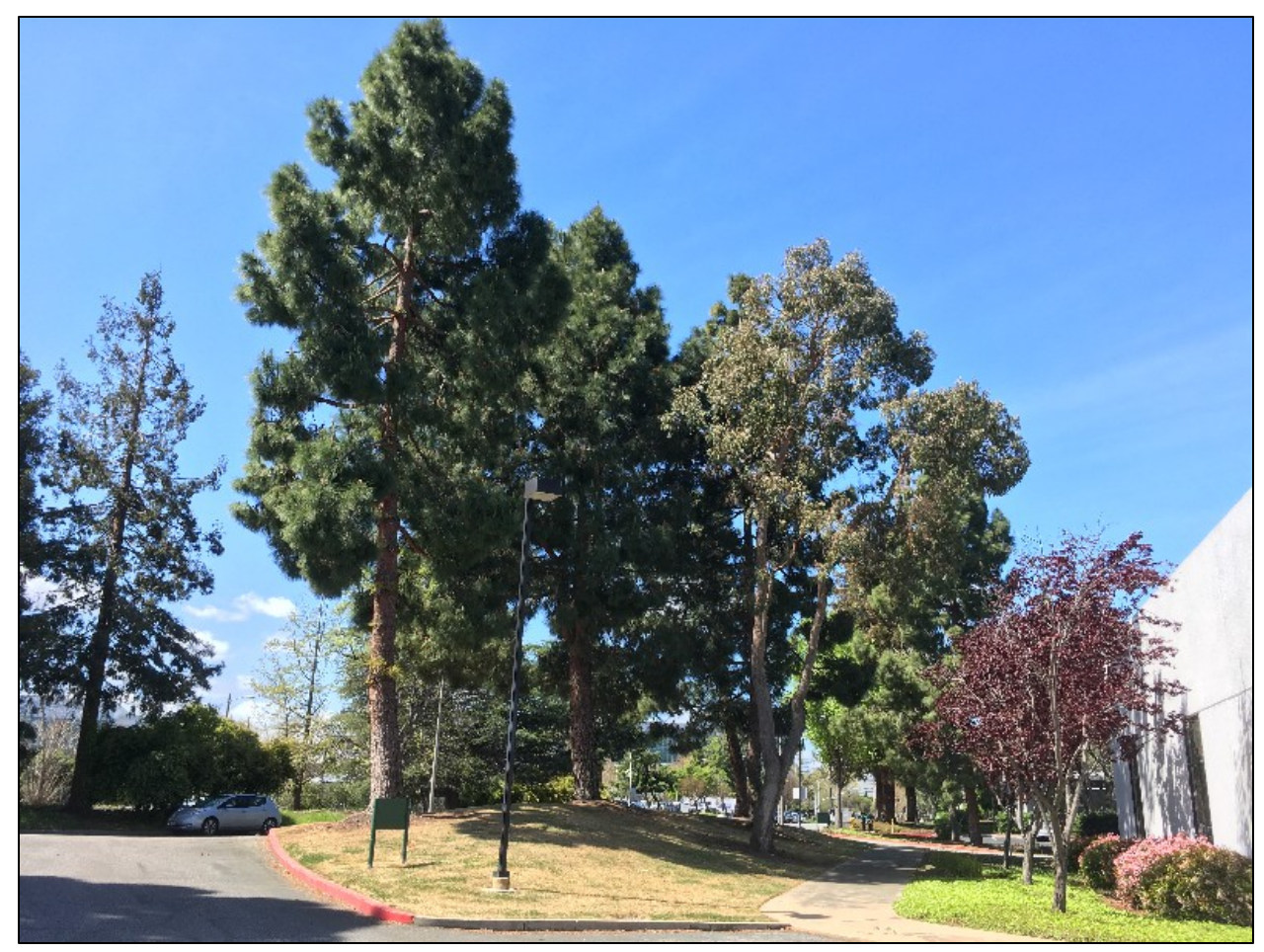
Photo 2. Tree 1006 (left side), Canary Island pine ( Pinus canariensis ). Tree #1011 (right side), purple leaf plum ( Prunus cerasifera ).