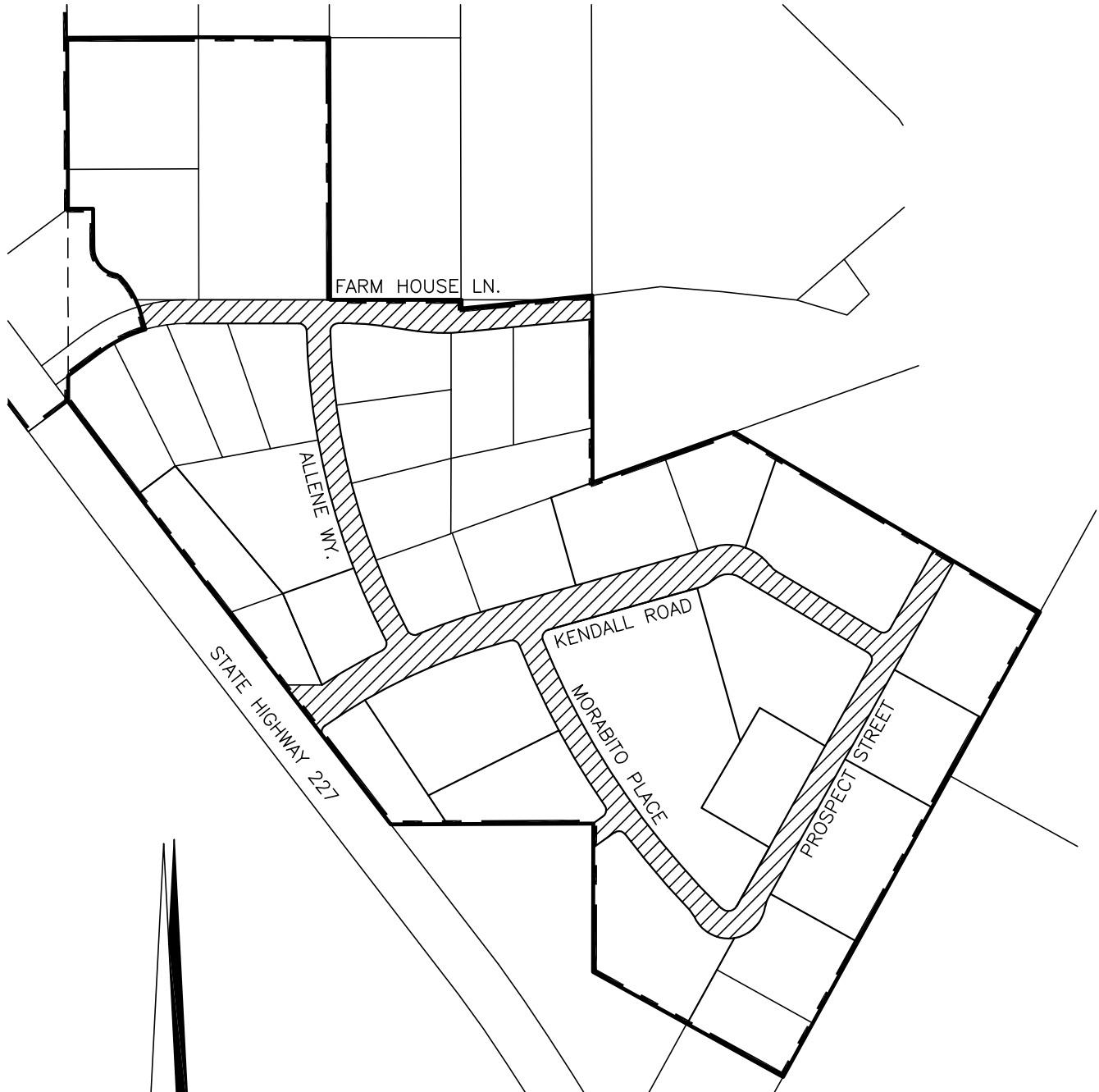
EXHIBIT "F" OFFER OF DEDICATION